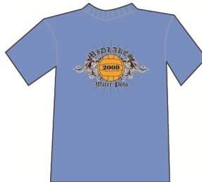
Item #2 Tee Shirt Carolina Blue Youth S-L, ADULT S-XL - $15.00