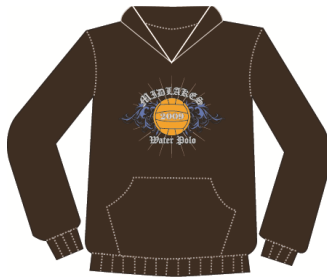
Item #1 Hooded Sweatshirt Chocolate Brown Youth S-L, ADULT S-XL - $30.00